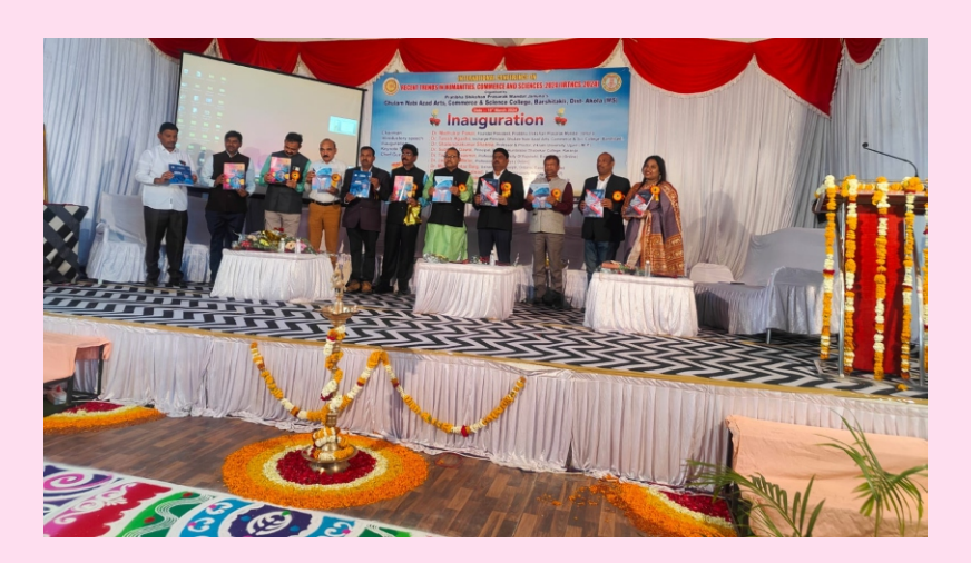
आंतरराष्ट्रीय परिषदेत स्मरणिका प्रकाशन सोहळा