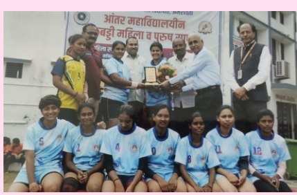
आंतरमहाविद्यालयीन उपविजेती चमु (कबड्डी)